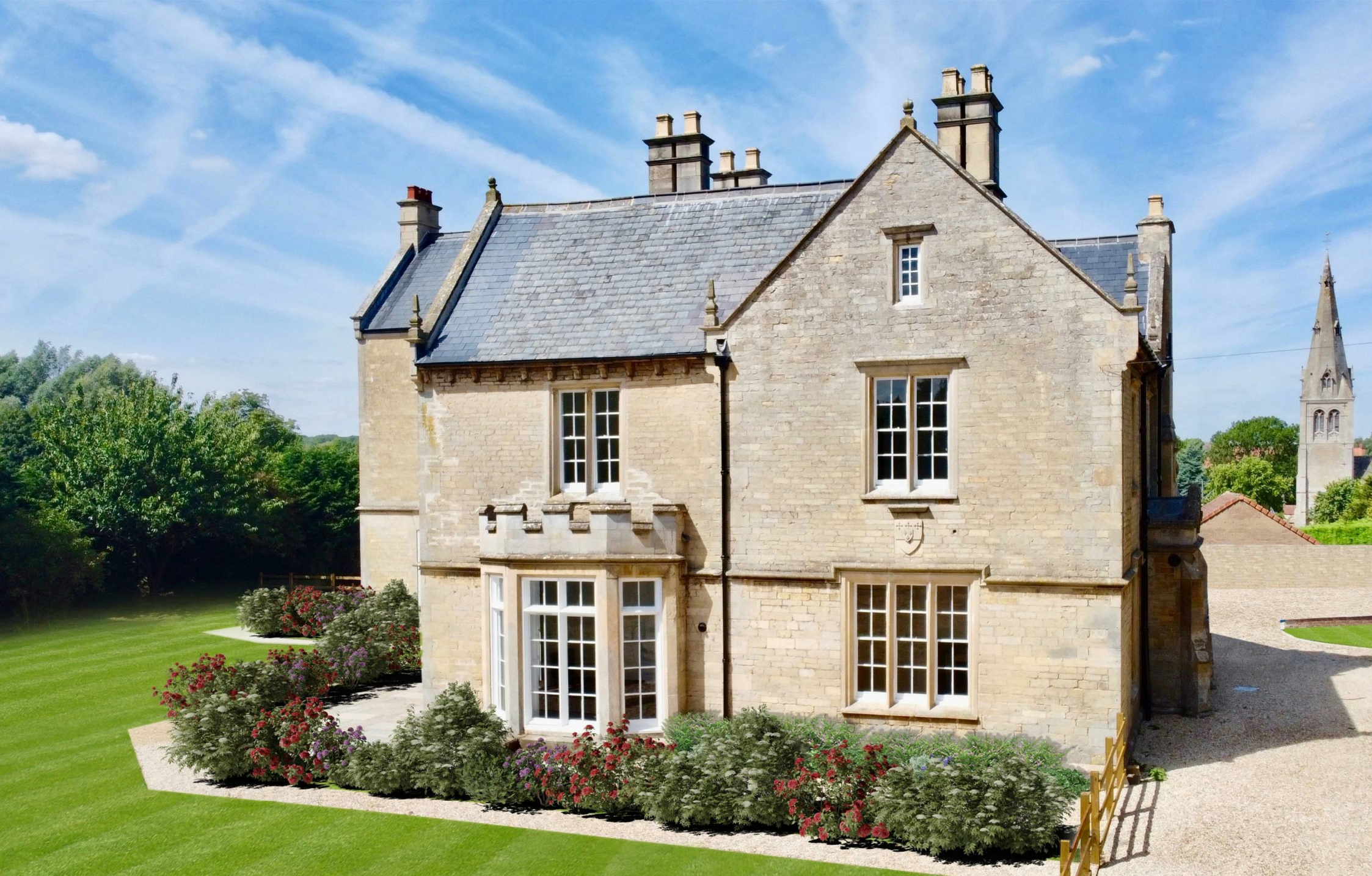
Leasingham Hall Sleaford